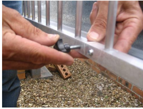
Securing ladder sections