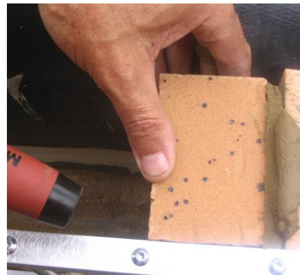
Top and bottom bars hold each brick in place