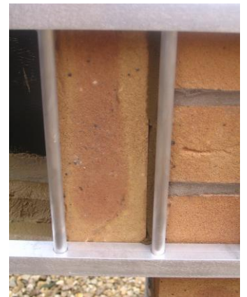
Each brick is laid behind Laurens Ladder using the top bar as a level and the vertical bar as a mortar joint gauge

BLAKES BUILDING PROFILES THE ORIGINAL BRICKIE'S BEST FRIEND