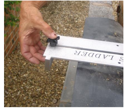
Clamps adjustable for cavity width