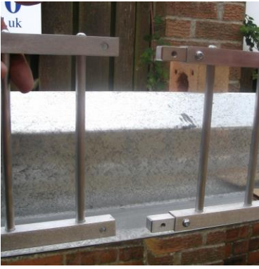
Ladder sections easily connected