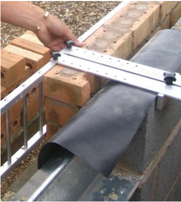
Gauge set by aligning rung