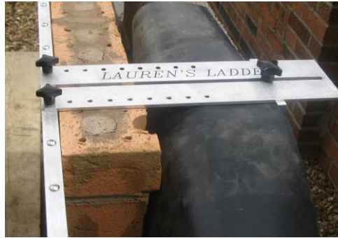
Two clamps secure Laurens Ladder