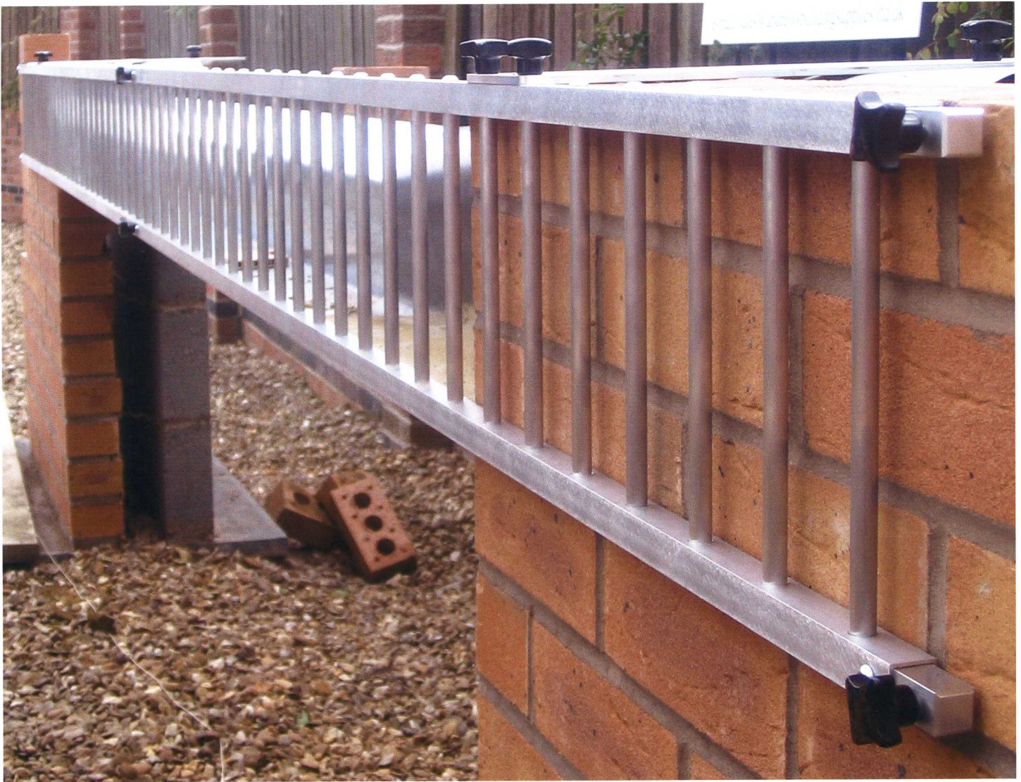
Laurens Ladder covers 49 courses in this application, (51 courses in band courses)