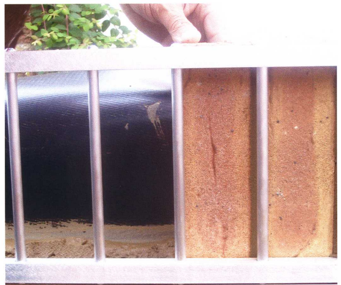
No need to check with a spirit level, align each brick with top bar.