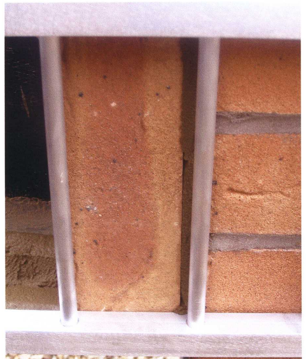
Top and bottom bars hold each brick in place.