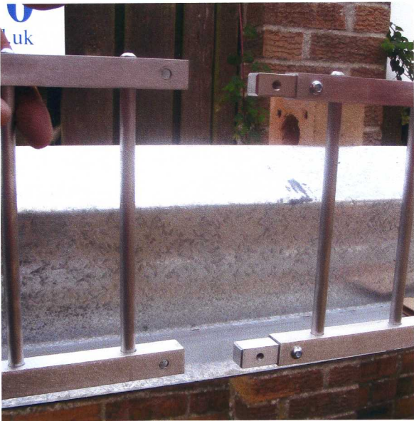
Ladder sections easily connected