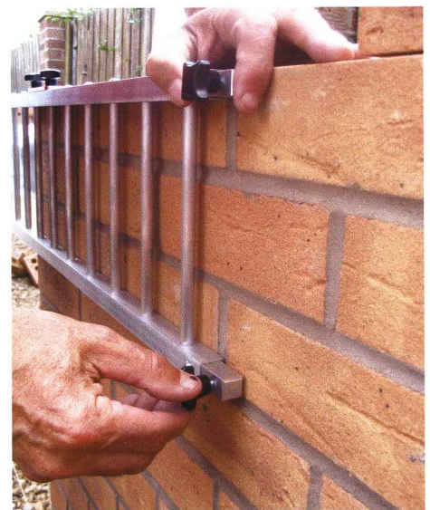
Adjuster screws allow the face of Laurens Ladder to be tilted