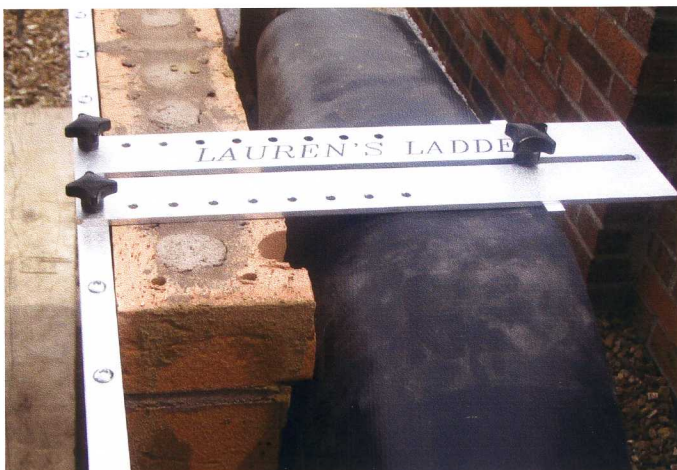
Two clamps secure Laurens Ladder