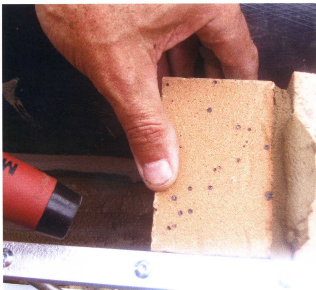
Each brick is laid behind Laurens Ladder using the top bar as a level and the vertical bar as a mortar joint gauge