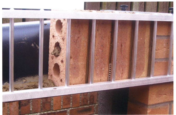
Courses are laid more quickly and accurately, and Laurens Ladder holds them in place until set.