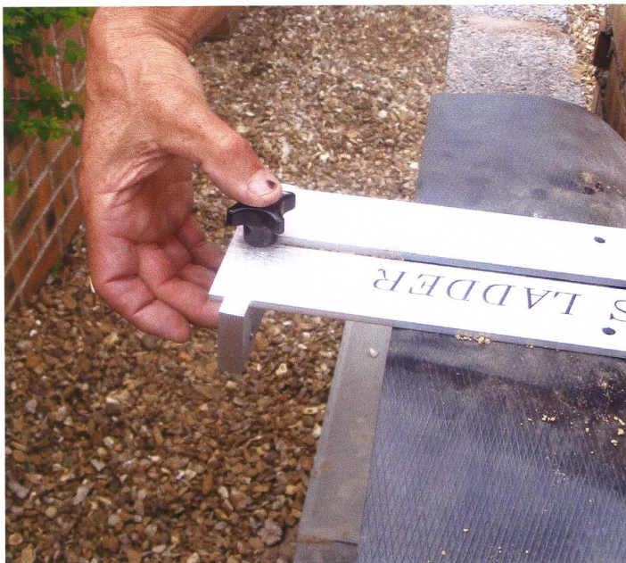
Clamps adjustable for cavity width