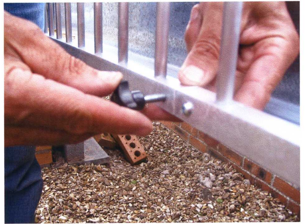
Securing ladder sections