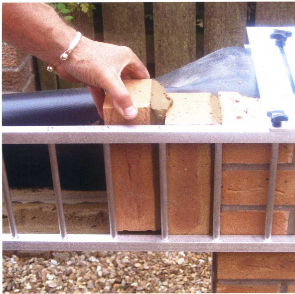
Each course accurately positioned and held in place.